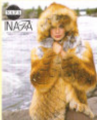
Red Fox - From Field to Fashion.

Fur Takers of America is about fur and trapping. We are proud to be trappers and want to ensure the future of this great American heritage. The Mountain Men taught each other how to trap and traveled in groups to provide protection against the Indians. Today, the animal rights activists and their supporters are our biggest threat. Many celebrities, magazines, TV news commentators, etc., gladly join in the attack. But, we are also threatened by a modern society that leads to fewer and fewer people that understand the natural cycles of life and death or the benefits of hunting and trapping. As our numbers decrease, we must join together to teach others how to trap, share the experiences and fun, and also to share in the efforts to protect our rights to continue to trap and wear fur.