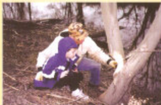
Preserving Our Heritage

If you are a trapper or are interested in trapping then you should join the FTA. Trapping is an activity for everyone: men, women, young and old.