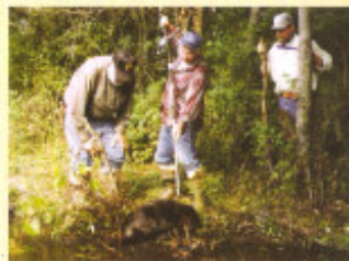
Trappers College Demonstration Includes "Catch and Release" - Nice Baiter!

The FTA Trappers College is the only one of its kind in the world. The college provides six days of in the field, hands-on training with some of the best trappers in the world serving as instructors. The field experience is backed up with classroom instruction to provide the most extensive training for both beginners and experts.