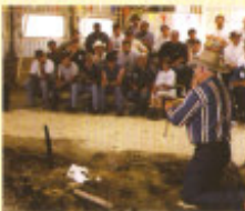
Lessons from the Pros at the FTA National Conventions.

is held in a different location each year. Trappers from all over the country come to participate in an assortment of fun and educational activities. These include live demonstration by experts on trapping, skinning and fur handling, predator calling, etc. Also, there are trap setting contests, a fund raising auction (lots of fun), and more. Lots of trapper supply dealers and a flea market setup for trappers are also a big attraction.